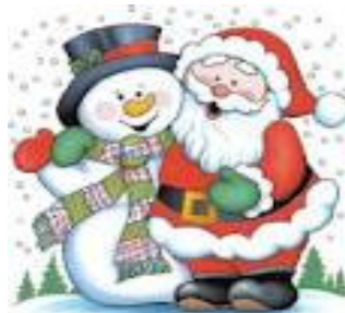
Christmas joy warms the heart

Your immediate family members are eligible to join SPCU. Spouse, children, grandchildren, sisters, brothers etc. If they are good enough for you, then they are good enough for us.